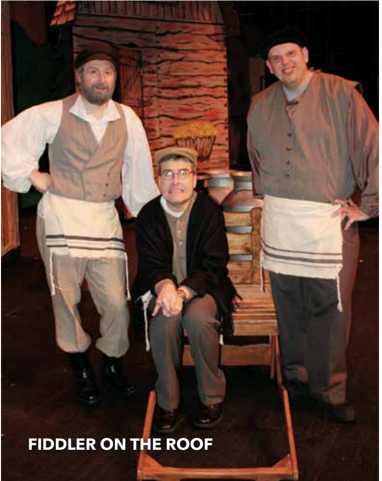
FIDDLER ON THE ROOF